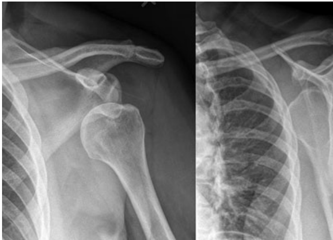
Figure 1. Anteroposterior and scapular Y radiographs demonstrate subcoracoid glenohumeral dislocation.