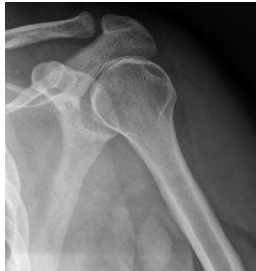
Figure 3. Postreduction anteroposterior radiograph confirms successful reduction of glenohumeral dislocation.